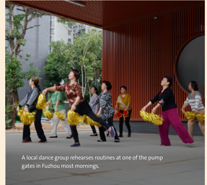
A local dance group rehearses routines at one of the pump gates in Fuzhou most mornings.