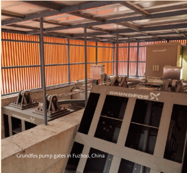
Grundfos pump gates in Fuzhou, China